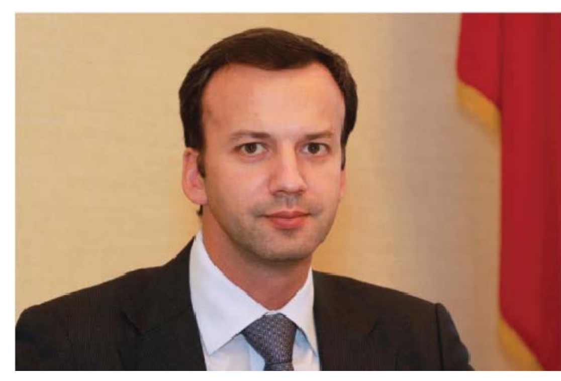
A.V. Dvorkovich Chairman of the Organizing Committee, Deputy Prime Minister of the Russian Federation

The Organizing Committee included the presidents and CEOs of major Russian oil companies, major banks, supervisors and Academicians, representatives of the federal government, the Government of Moscow.